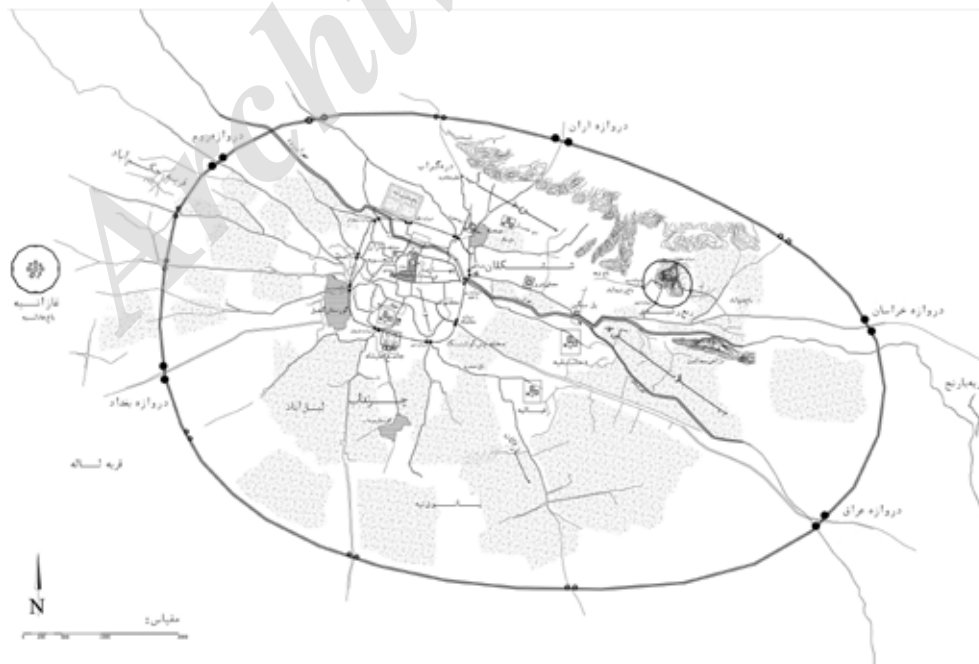
Fig. 3. The schematic design of the spatial structure of the city of Tabriz until the mid-eighth century AH, with the area of Gāzāni wall and its five main gates, the limited area of the old city, the towns of Gāzāniyeh and Rab'-i Ra'sīdi, and Abvāb al-bīrs, are marked on the map.