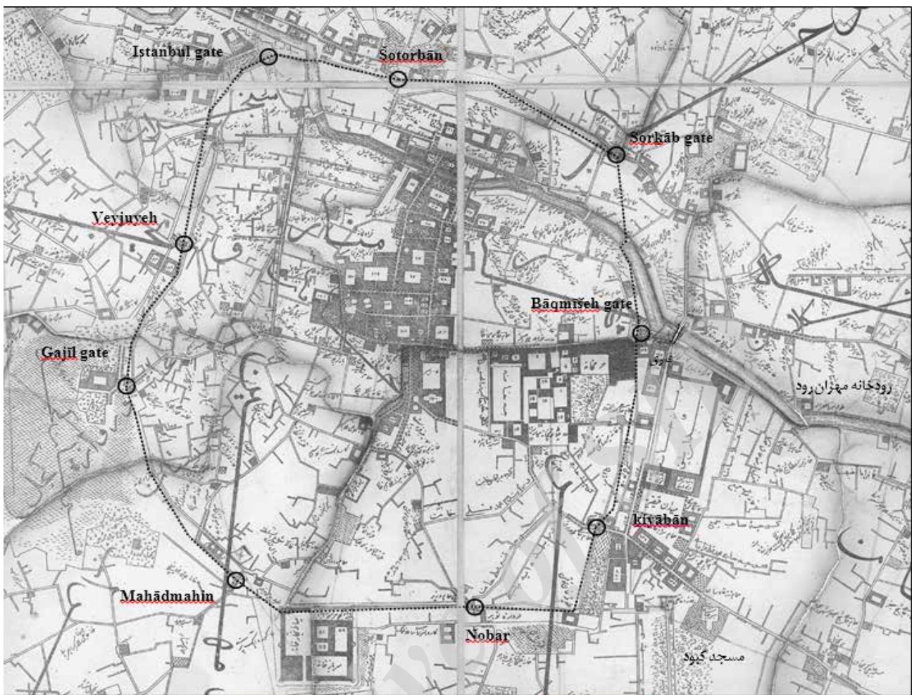
Fig. 1. Part of Tabriz's Dar-al-Saltaneh map, depicted by Colonel Qarajeh-Dāgi (1297AH /1880). In this image, the boundaries of Najafqoli-Qāni walls and the location of its gates are specified.

Gate is equal to the kiyābān Gate of Najafqoli-Qāni wall. Hence, this gate was connected to the first region (: Mehrān-Rud) of the seven surrounding regions of Tabriz. Also it was located along the Iraq-e-Ajam road (Tabriz, Sa'idābād, Ojān, Miyāneh, Soltāniyeh).