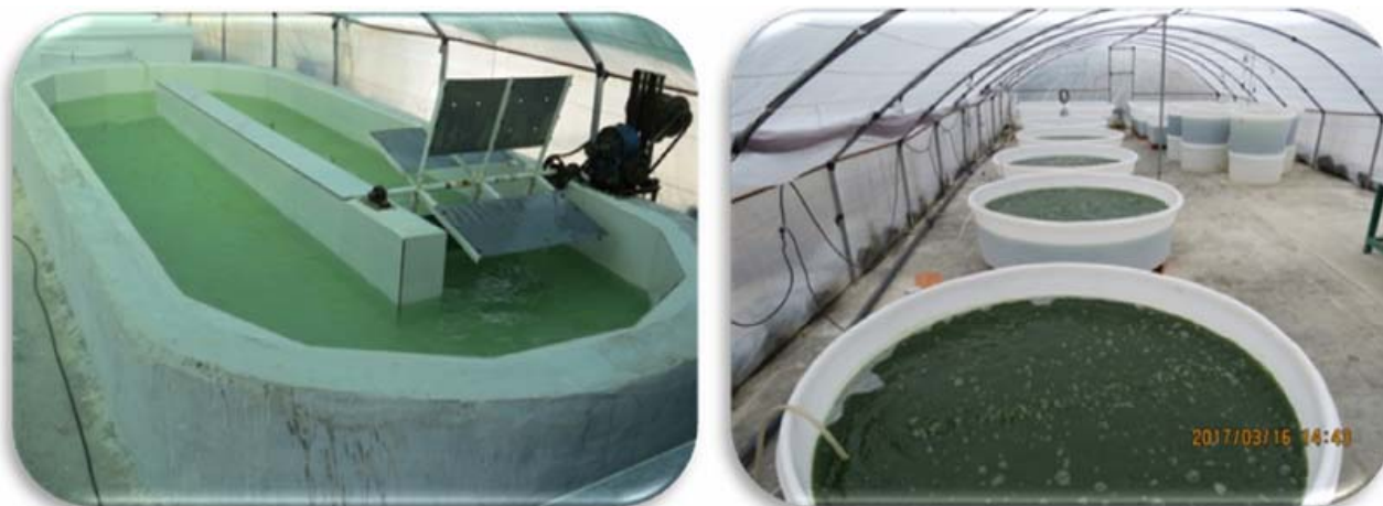
Figure 1 Spirulina platensis rearing condition

1 Mineral premix supplied the followings per kilogram of diet: vitamin A: 10000 IU; vitamin D 3 : 3000 IU; vitamin E: 20 IU; vitamin K 3 : 2 mg; Thiamin: 2 mg; Pyridoxine hydrochloride: 4 mg; Cobalamin: 0.06 mg; Calcium-D-pantothenate: 20 mg; Nicotinic acid: 50 mg; Folic acid: 1 mg; Riboflavin: 8 mg; Biotin: 0.2 mg; Cu: 10 mg; Fe: 60 mg; Zn: 60 mg; Mn: 80 mg; Se: 0.3 mg and I: 0.2 mg.