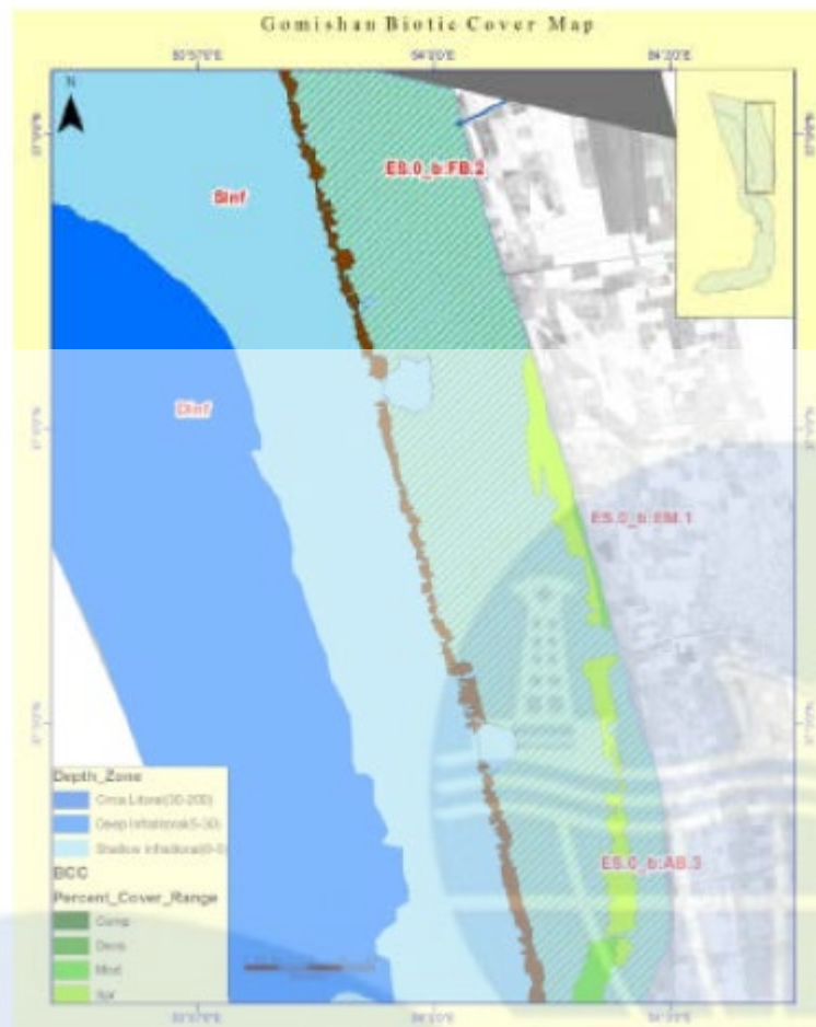
Fig. 3) Gomishan BCC Map

CMECS has divided geomorphological components into natural and anthropogenic (man-made) categories. The Caspian sea belongs to natural geomorphology, in which has the characteristics of an enclosed sea, so that it receives the code: g:11.n.SInf. Gomishan lagoon inlets and sand bar have coded as g:11.g and g:11.m/f respectively. Dredged channel as an anthropogenic geomorphology has code as a-dg. Fig. 5 shows the coded station in respect to their geomorphology codes.