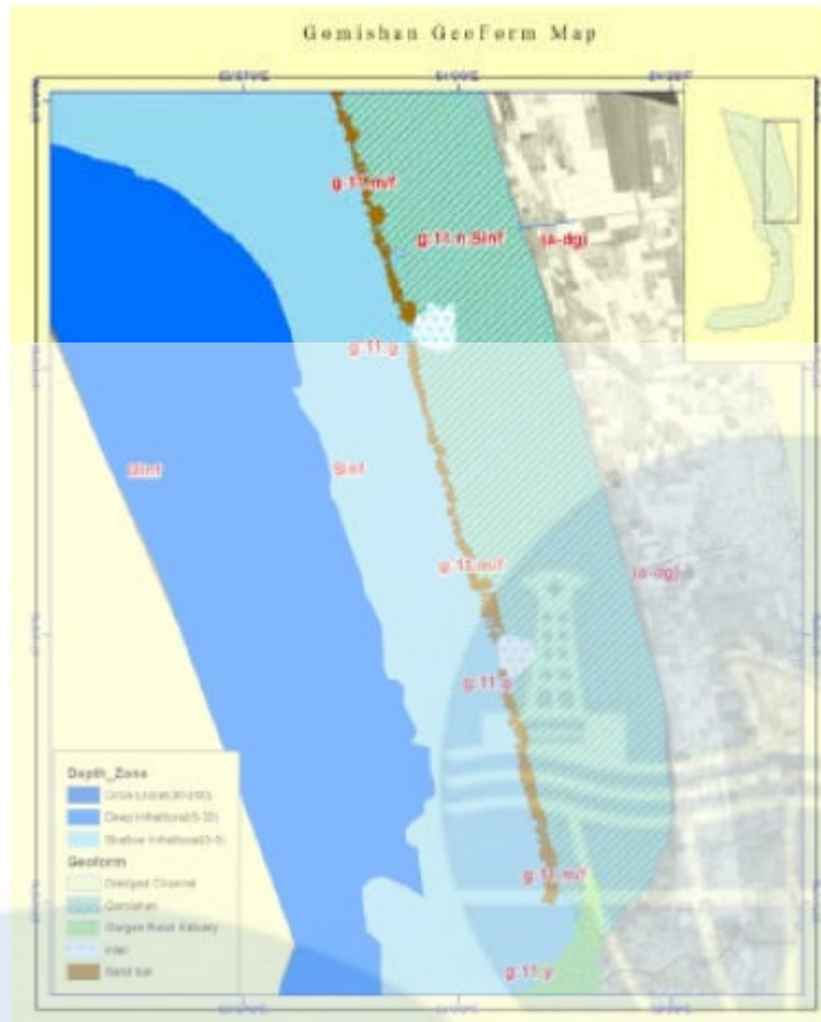
Fig. 4) Gomishan GFC Map