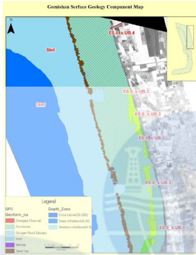
Fig. 2) Classified Map of Gomishan wetland Applying CMECS Surface Geology Component

On this basis of BCC classifiers three different environmental zones (emergent wetland, aquatic bed and faunal bed) were recognized and coded as [ES.0_b:EM.1], [ES.0_b:AB.3] and [ES.0_b:fb.2] (Fig. 3).