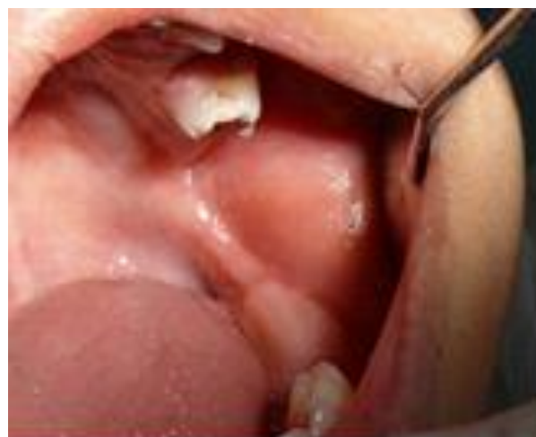
Fig. 3: Pterygomandibular triangle: the visible lower tip was considered as the correct point of needle insertion

perform local anesthesia using visual method to determine the point of needle insertion, the child was requested to open his/her mouth as much as possible.