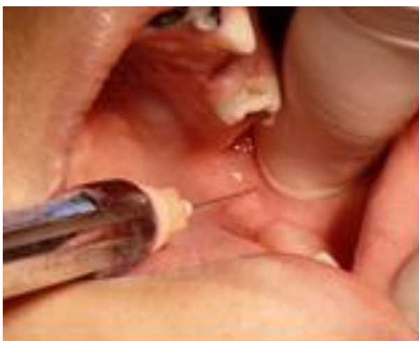
Fig. 2: Performing IANB using tactile method to find needle insertion point