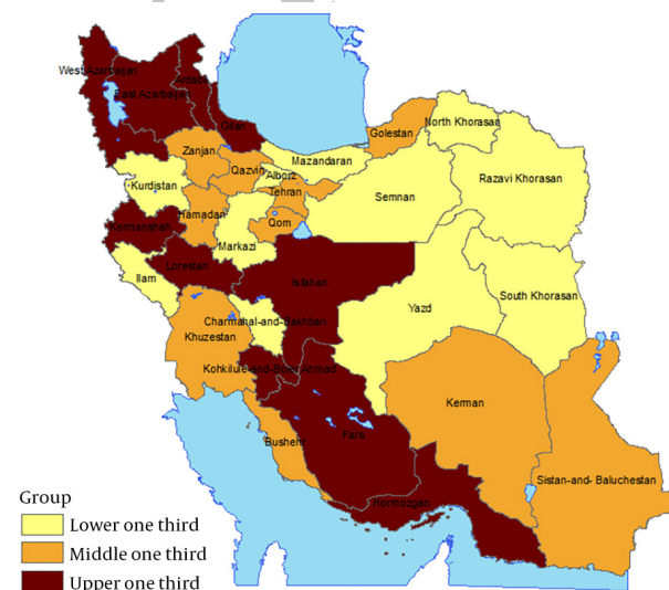
Figure 2. Distribution of Abortions Without Medical Indications in the Last Year