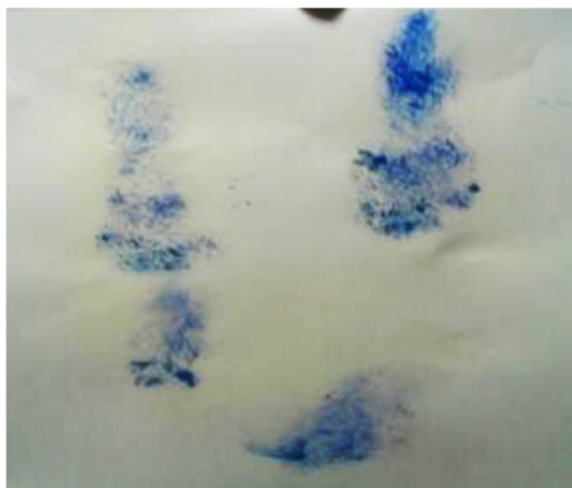
Fig. 3. A rabbit's footprints sixteen weeks post-surgery.