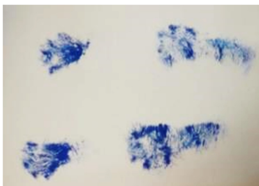
Fig. 1. A rabbit's footprints before the implementation of the experimental methods.

In a study investigating 28 rats, Yuki Iijima et al. (2016) reported that the vascularization of artificial nerve conduits accelerated the peripheral nerve regeneration. For the purpose of the study, they removed a 13-mm segment of the sciatic nerve and then pressed a heated iron against the dorsal thigh muscle to produce a burn. The defects were immediately repaired with an autograft (n= 10),