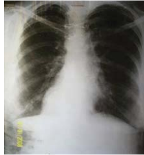
Figure 1. Chest X-ray showed not only the presence of bronchiectasis, particularly in the lower zones, but also dextrocardia.