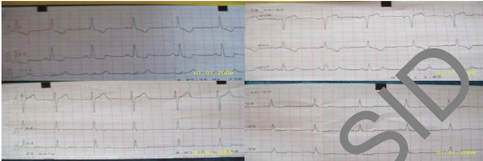
Figure 2. ECG of the patient remarkable for a T wave inversion in II, III, and aVL.