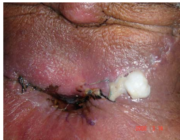
Figure 1. PCF in the left side of ostoma.

In our series, the presence of a systemic disease, history of previous radiotherapy, and a positive surgical margin were significantly associated with fistula formation. Conversely, there were no statistically significant differences between the