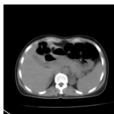
Figure 1. CT scan of the adrenal gland, Arrow shows left adrenal mass.

After infusion of 2 liter 0.9% saline solution in 4h plasma, aldosterone was very high. Plain computed tomography image of the abdomen showed a mass measuring 3.2.2 cm in the body, and inner arm left adrenal gland (Arrow, Figure 1).