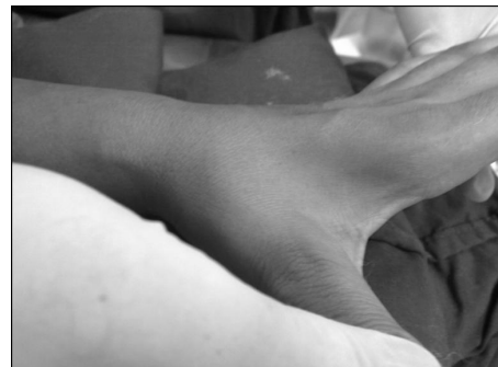
Figure 1. Wasting of first dorsal interosseus muscle

Diagnosis of ulnar nerve compression at the wrist - Guyon's tunnel syndrome - was made, regarding clinical presentation and electrodiagnostic studies. Surgical exploration of the ulnar nerve at the wrist was undertaken. Under general anesthesia, an incision was made on the antero-medial aspect of the left wrist and the ulnar nerve was explored cautiously. Approximately, six cm proximal to the pisiform bone; the ulnar nerve was divided into two branches. One branch comprising about three fourths of