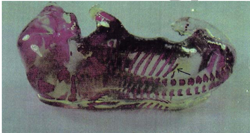
Fig. 2. Rat fetus of a valproic acid treated dam in day 20 of gestation. Interrelated malformations of vertebrae (a) L1 present as a right hemivertebra with (b) asymmetry of centra T13 and L2.