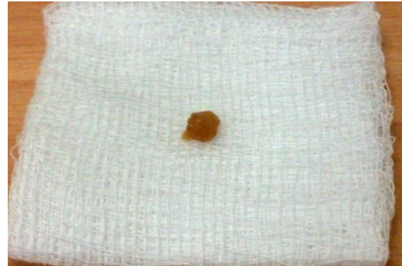
Fig 2: Candle wax after removal

drop was pulled out using a semi-sharp hook manually angulated to properly reach to the back of the foreign body. Post removal, the patient felt transient dizziness.