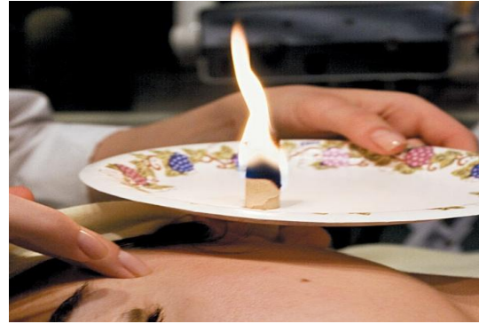
Fig 3: Ear candling procedure

The most common practice is to have the customer to lie to his/her side. The exposed ear may be safeguarded by a collecting plate on top, and then the candle will be inserted into the ear canal through the hole in the plate. Now the candle is lit, and the hole in the top of the candle is maintained open throughout the procedure by trimming the wick or using instruments like a toothpick (Fig 3).