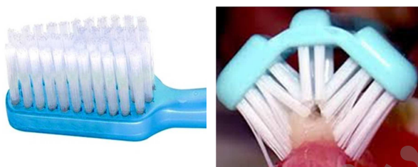
Figure 1. From left to right: Classic toothbrush and Superbrush

All the selected subjects met with the following criteria: minimum of 20 natural teeth, the absence of underlying systemic disease with a detrimental effect on the periodontal condition, lack of caries. The exclusion criteria were as follow: pregnancy, history of drug/alcohol abuse, smoking or chewing tobacco, use of any medication and presence of: orthodontic appliances or implants, crowding of the teeth, restorations with overhangs, extensive restorations; partial prosthetic rehabilitation or/and bridges, deep pockets, severe periodontal disease and mouth-breathing. 14,16