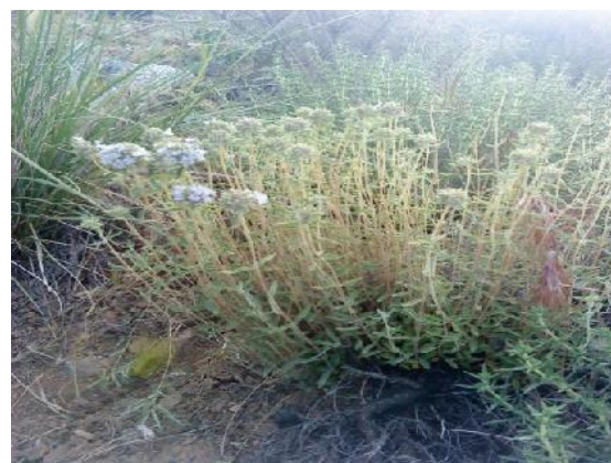
Fig. 2. The plant Satureja hortensis in its natural habitat, Sheyda district in Chaharmahal and Bakhtiari Province, south-western of Iran (original)