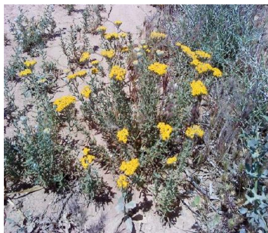
Fig. 1. The plant Achillea vermiculata in its natural habitat, Armand district in Chaharmahal and Bakhtiari Province, south-western of Iran (original)

We did not observe any significant differences between ED_{50} and ED_{90} of S. hortensis and A. vermiculata by T-test and P > 0.001 analysis.