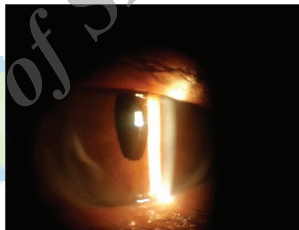
Figure 2. Slit lamp examination after extra capsular cataract extraction showing vertically oval dilated pupil.