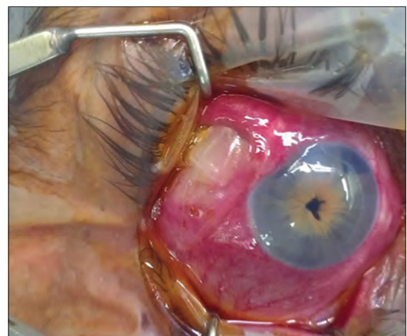
Figure 3. Plate exposure in the second patient 5 months after Ahmed Glaucoma Valve implantation with adjunctive subconjunctival bevacizumab.