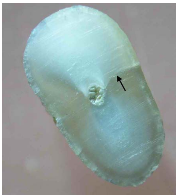
Figure 1. Black arrow pointing to a fracture