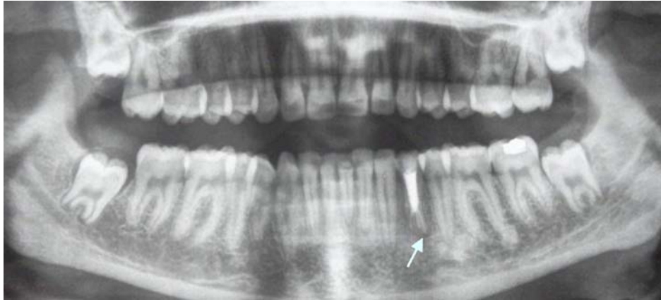
Figure 3. Panoramic view showing obturation of unilateral three rooted mandibular left first premolar

Maillefer, USA) using AH Plus sealer (Dentsply, Maillefer, USA) (Figures 1C and 1D).