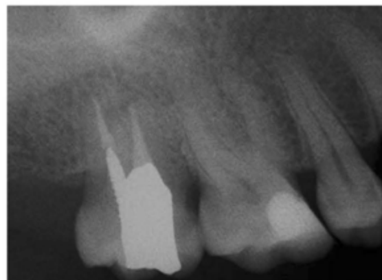
Figure 8- Recall radiograph revealed complete healing of periapical lesion

(Ariadent, Tehran, Iran) and Roth 801 root canal sealer (Roth International LTD, USA), and the coronal access sealed with IRM (Caulk, Milford, DE, USA). A postoperative radiograph revealed densely condensed root canal fillings in the two canals. The crown was then restored permanently with amalgam. The recall examination after 1 year revealed that periodontal condition was healthy, the tooth was asymptomatic, and complete bone regeneration was seen on the radiograph.