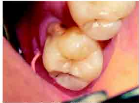
Figure 3- occlusal view of fused teeth and traced gutta-percha placed in the sinus tract