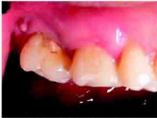
Figure 1- intraoral view of the fused second maxillary molar and a parulis