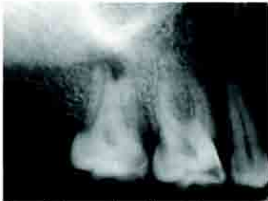
Figure 2- Preoperative radiograph demonstrated periapical radiolucency and abnormal roots