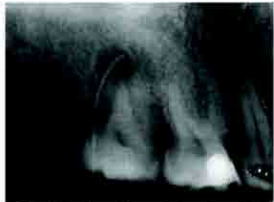
Figure 4- Tracing radiograph shows the origin of lesion is endodontic

This case report describes the endodontic management of a maxillary second molar fused with a supernumerary.