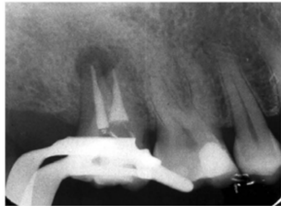
Figure 7- postobturation radiograph