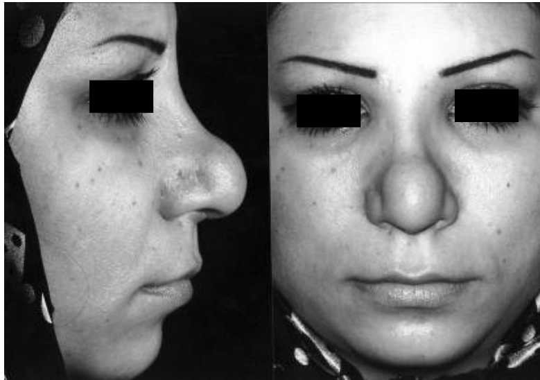
Fig. 2: Well defined round mass in tip and supra tip after fibrinolysin injection. Left: profile view, Right: frontal view.