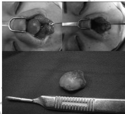
Fig. 3: Discrete round mass was found and resected during the last operation.

traditional reduction rhinoplasty. 4 Nowadays, facing a middle eastern nose, surgeons use cartilage conservation instead of previously reduction techniques.