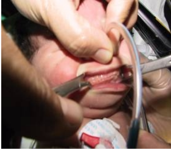
Figure 1: One-day-old boy with fused jaw.