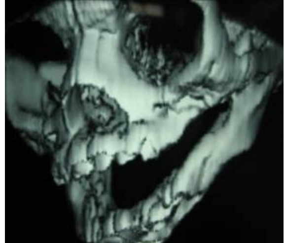
Figure 3: Postoperative three dimensional tomogram showing well separated jaws.

Breast feeding was started 1 day later with good sucking and the patient was discharged. Three dimensional CT showed well separated jaws (figure 3).