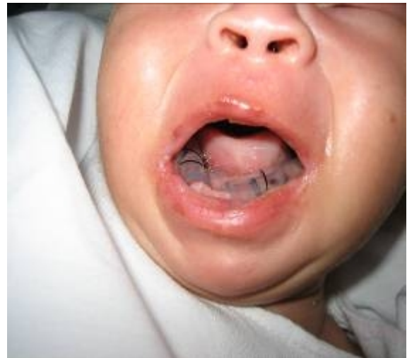
Figure 4: Postoperative appearance with full opening of the mouth. Rubbers were sutured to the mandible to prevent re-fusion of the jaws.

Three weeks later, the patient was brought back to the hospital because of difficulty in adequately opening the mouth as a result of re-fusion of the jaws. The patient was once again transferred to the operating room. She was easily intubated through the mouth. Thick bony re-fusion had occurred posteriorly. Thus re-osteotomy was performed. Two half cylinder tubes were sutured over the site of osteotomy on the mandible to prevent re-adhesion (figure 4).